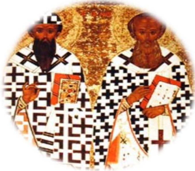
Ss Athanasius and Cyril