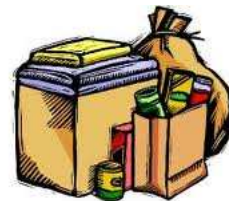
Food Pantry Donations Needed

Congratulations to our 1st Holy Confession class of 2015.