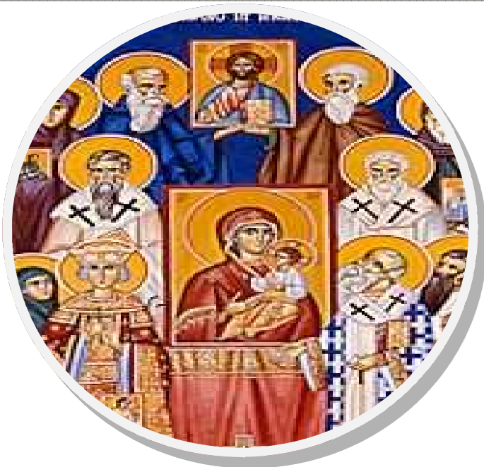
7TH COUNCIL RESTORED ICONS IN CHURCHES